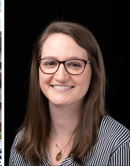
Program Associate & Advisor